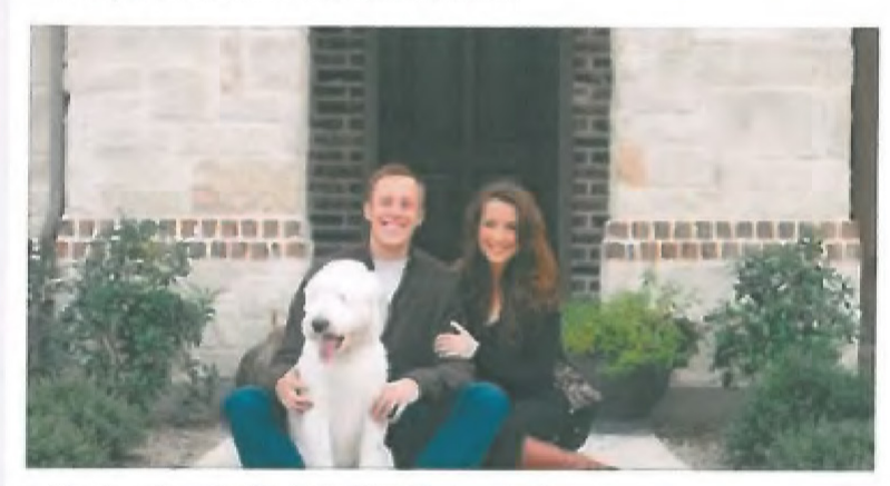
Caring for Carly | Inside Gymnastics 2004 Olympic Gold Medalis... INSIDE GYMNASTICS.COM

Fit Organic steps up to protect former Olympic gold medalist from mosquitoes that could transmit Zika virus: